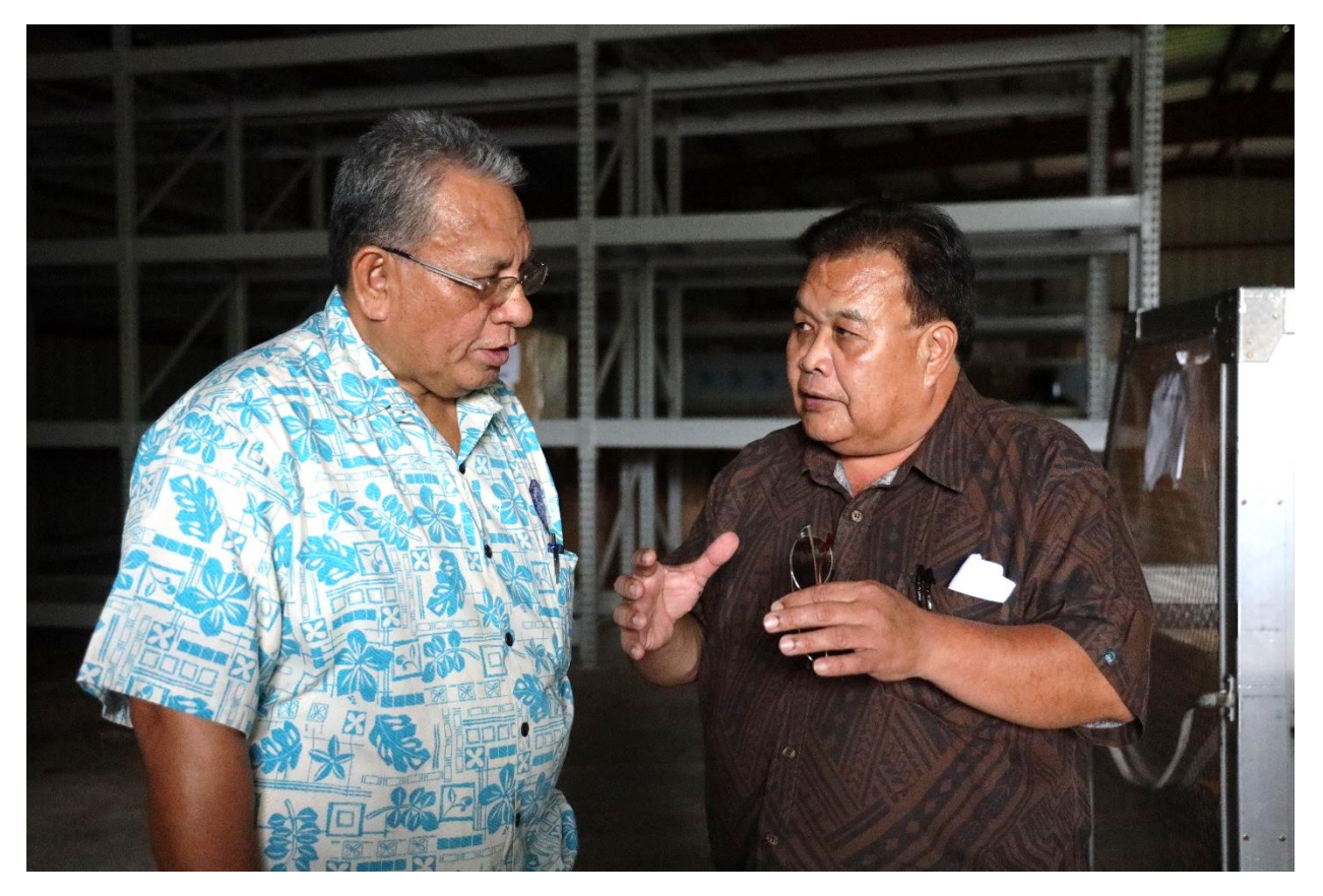
Pictured Above: Dr. Taulung & Governor Oliver discuss heightening collaboration between the FSM & Pohnpei COVID-19 Task Forces