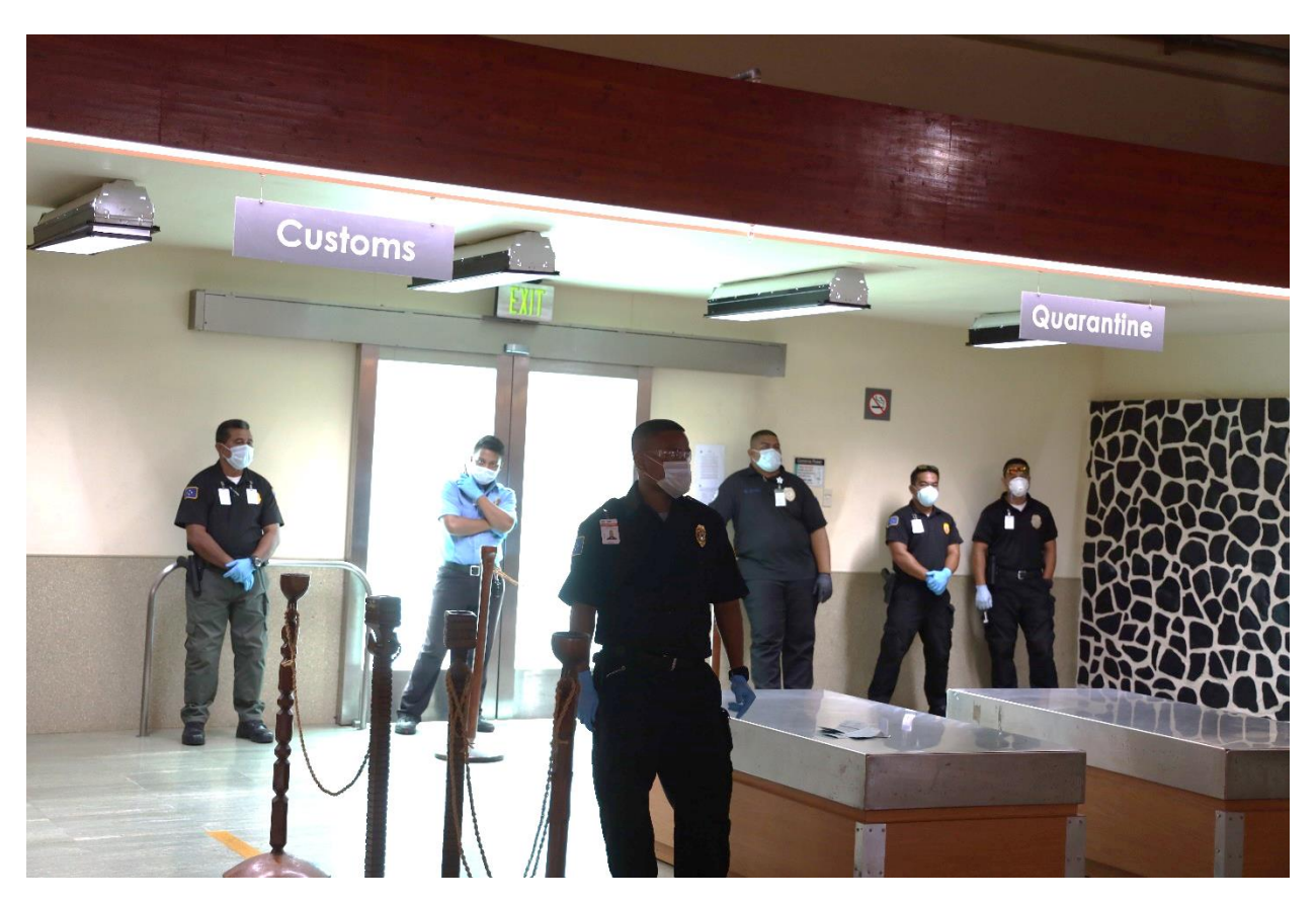
Pictured Above: Customs & Quarantine Officials