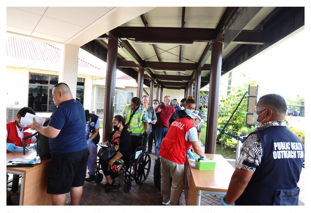
Pictured Above: Airport health screening at Pohnpei International Airport; in addition to reviewing the form filled out on the airplane, all individuals have their temperature taken among other measures

Non-FSM citizens remain discouraged from traveling to the FSM at this time. Travel to the FSM State of Chuuk is banned. Travel to the FSM State of Pohnpei, per a March 19<sup>th</sup> amendment to Pohnpei's Constitutional Emergency Order 20-01, is only allowed for Pohnpei State residents, with exceptions for medical capacity-building and technical personnel the state or Nation requests. Every traveler to the FSM at this time is subject to mandatory quarantine.