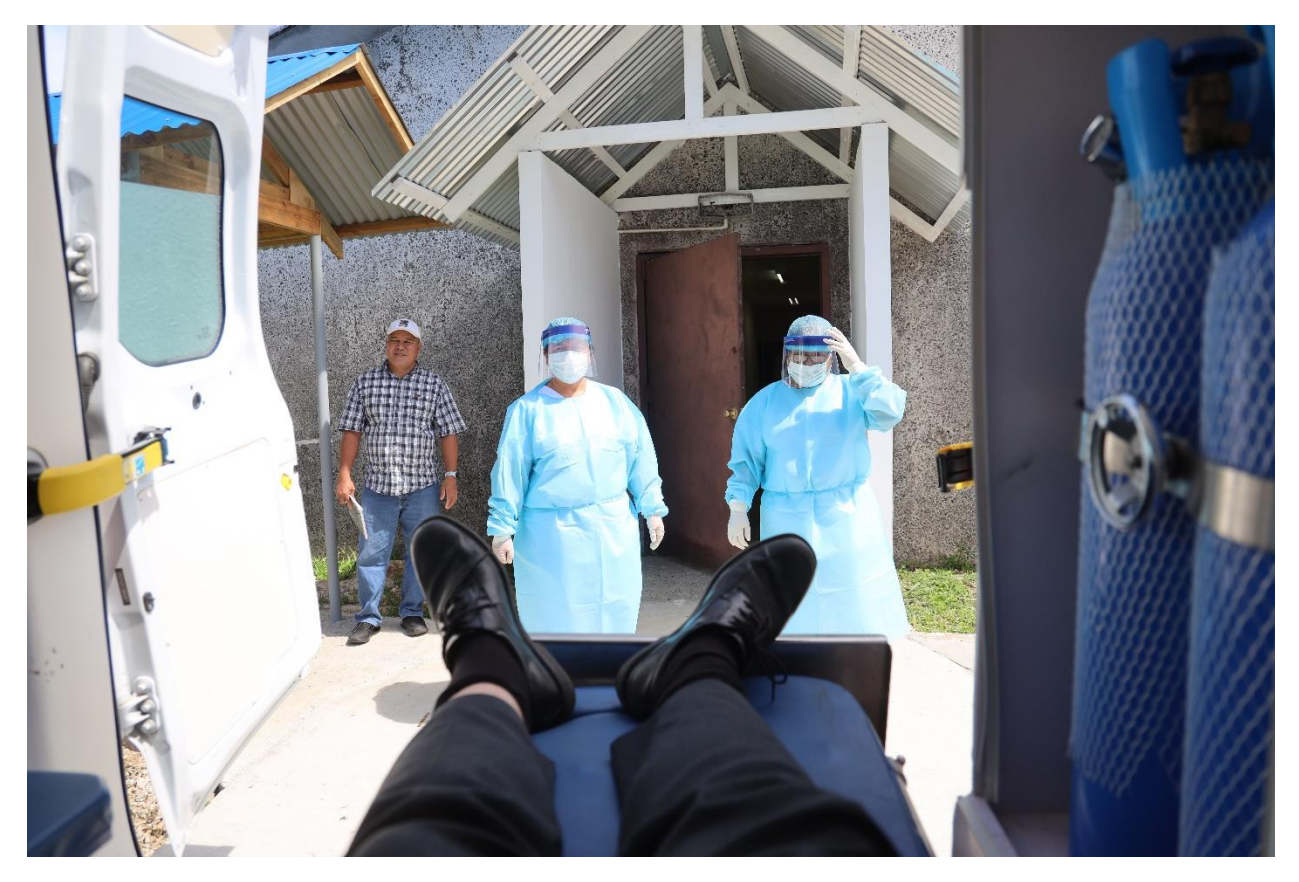
Pictured Above: The view upon arrival at the hospital