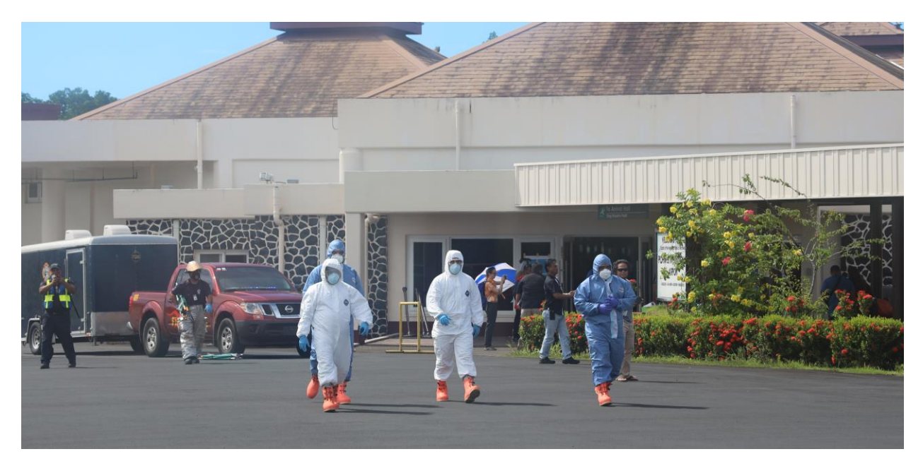
Pictured Above: First-responders simulate the arrival of FSM citizens coming from a COVID-19 jurisdiction, with a potential COVID-19 patient on board the aircraft