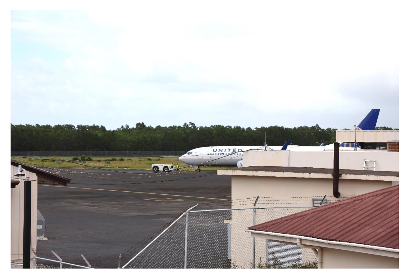
Pictured Above: A United Airlines, Inc. aircraft