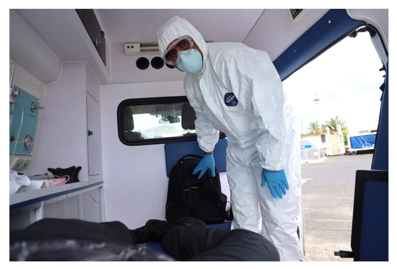
Pictured Above: A medical staff assists the potential COVID-19 patient into the ambulance