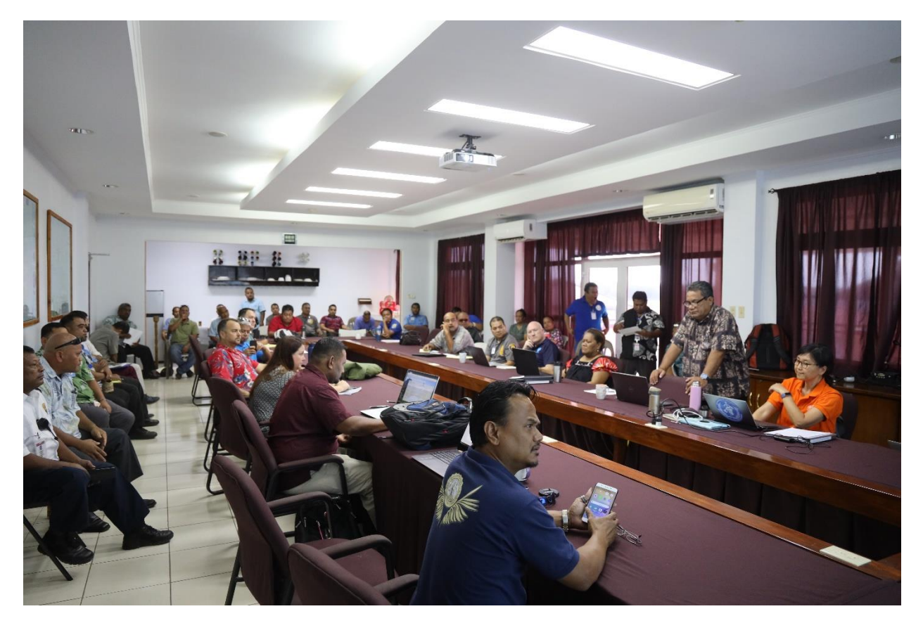
Pictured Above: The National and State simulation exercise team during the tabletop exercise