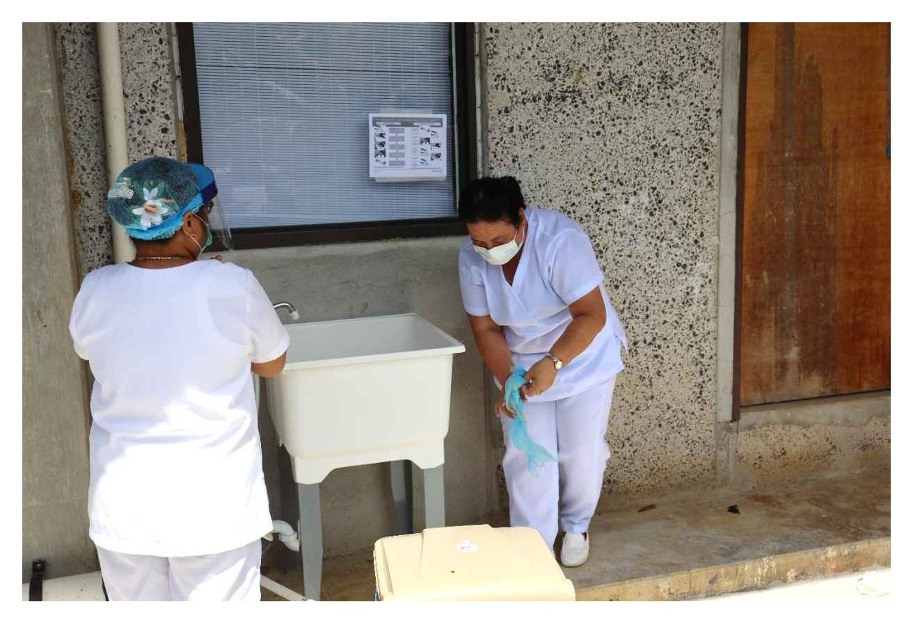
Pictured Above: Medical staff removing their PPE for disposal