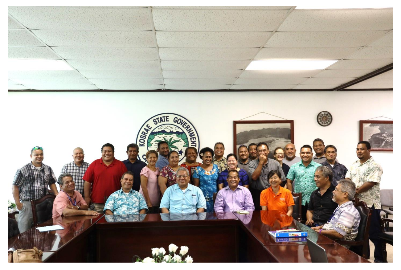
Pictured Above: The FSM & KSA COVID-19 Task Forces pose with Kosrae State Government's leadership

Other than the simulation exercises on July 18<sup>th</sup> and 22<sup>nd</sup>, the Task Force also conducted a series of community engagements with the Mayors of the Municipalities of Malem, Tafunsak, Lelu, and Utwe, as well as a series of contact tracing and PPE donning and doffing trainings, among others.