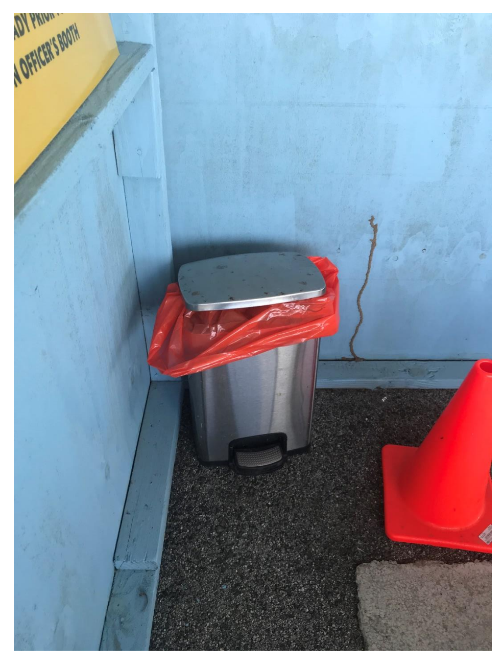
Pictured Above: A trash bin; it was advised that seemingly small things like this are the key to preventing COVID-19's entry into the FSM—a trash bin like this one is opened with your foot instead of your hand, making it easier to avoid contact and exposure