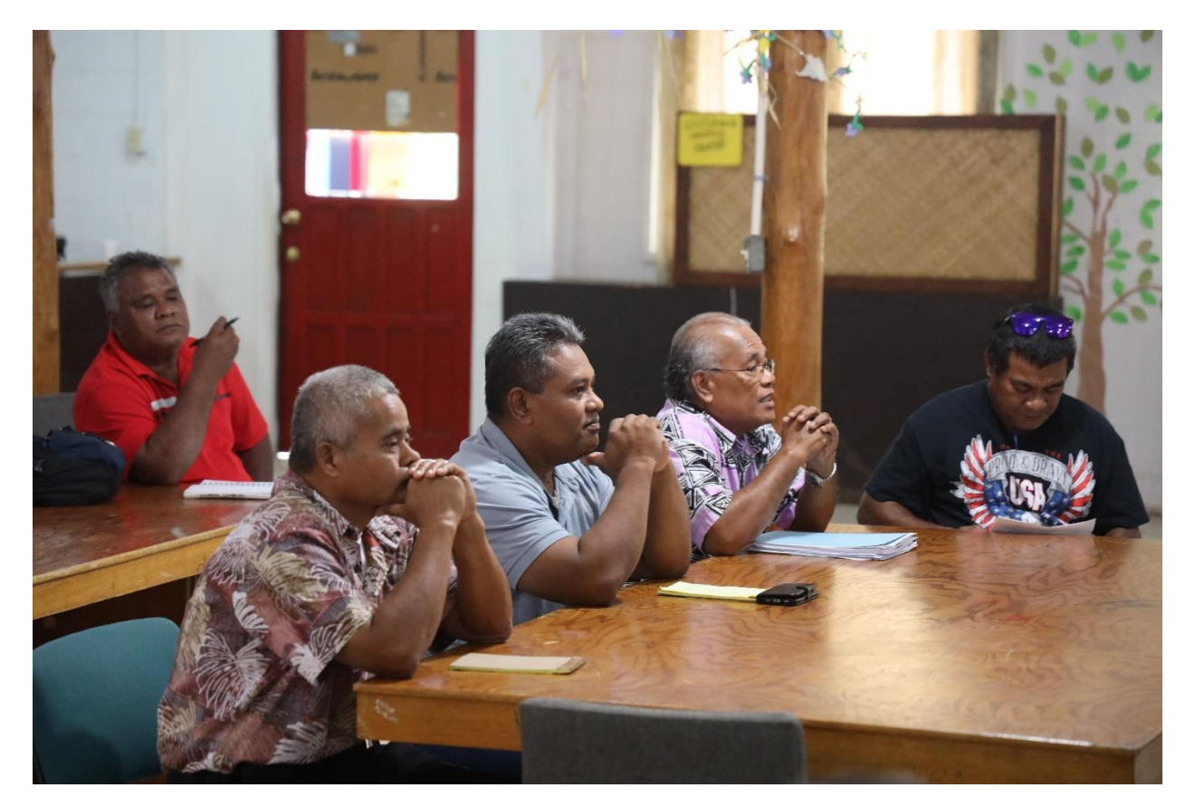
Pictured Above: Members of Kosrae's leadership ask questions during a community engagement meeting