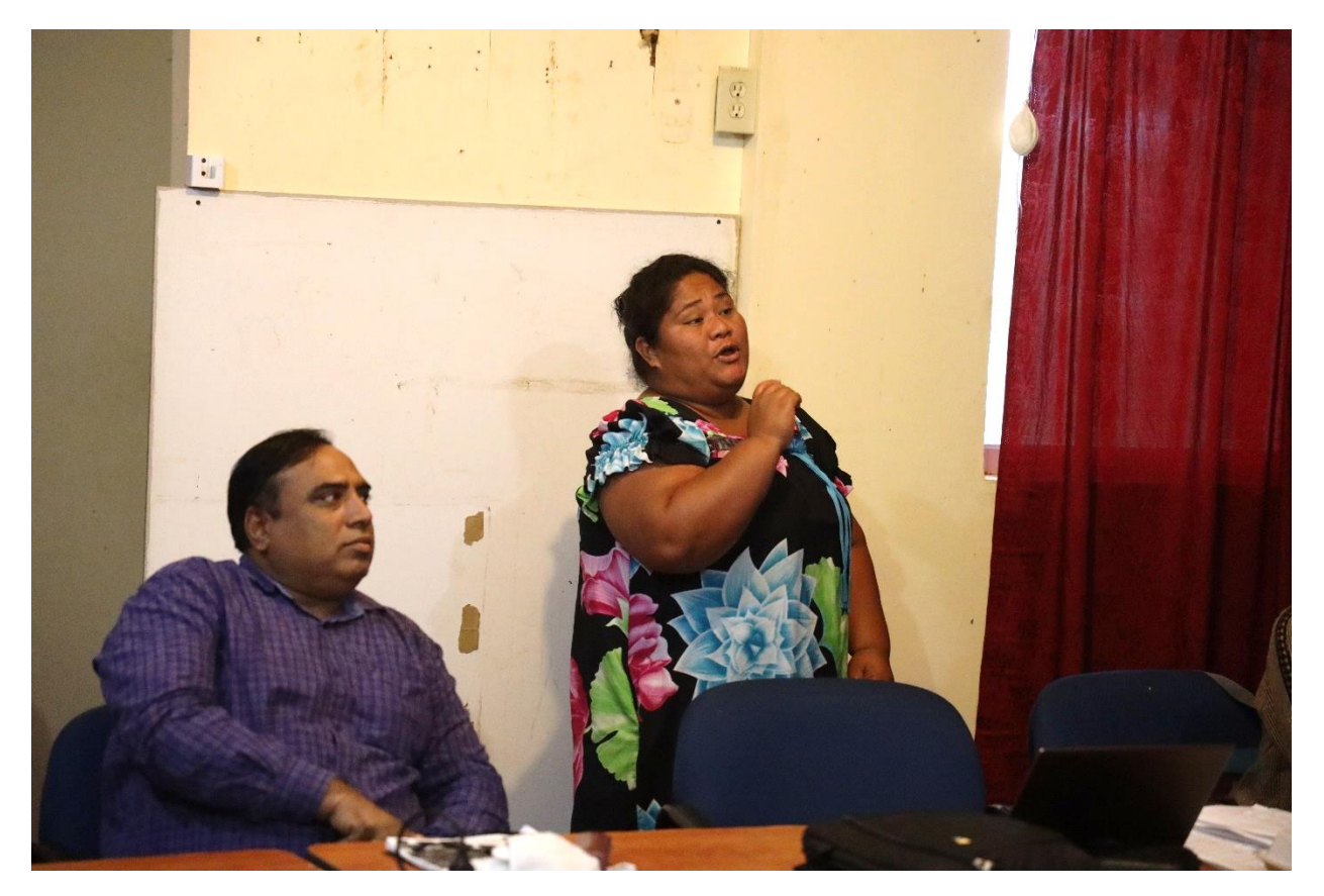
Pictured Above: A Kosraean first-responder asks questions during the contact tracing workshop