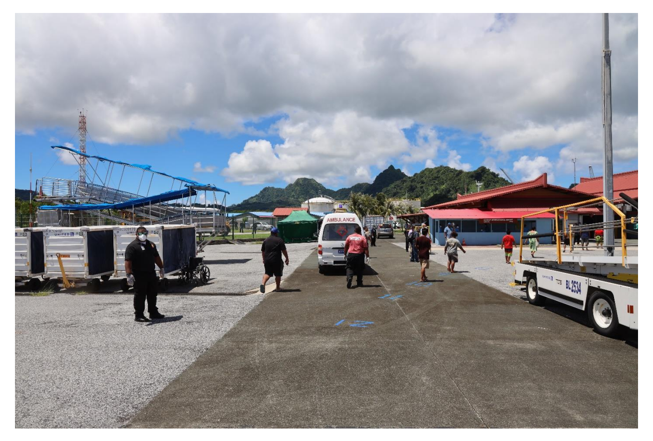
Pictured Above: The Point of Entry, as seen from a disembarking passenger; note the blue tape used to enforce distance between incoming passengers