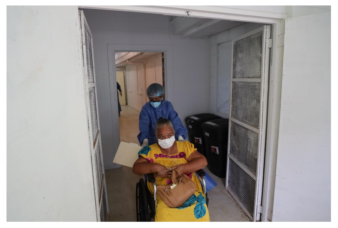
Pictured Above: A simulated PUI is taken to the Isolation Site; notice that the entryway has been altered so that it is easier to move to and from