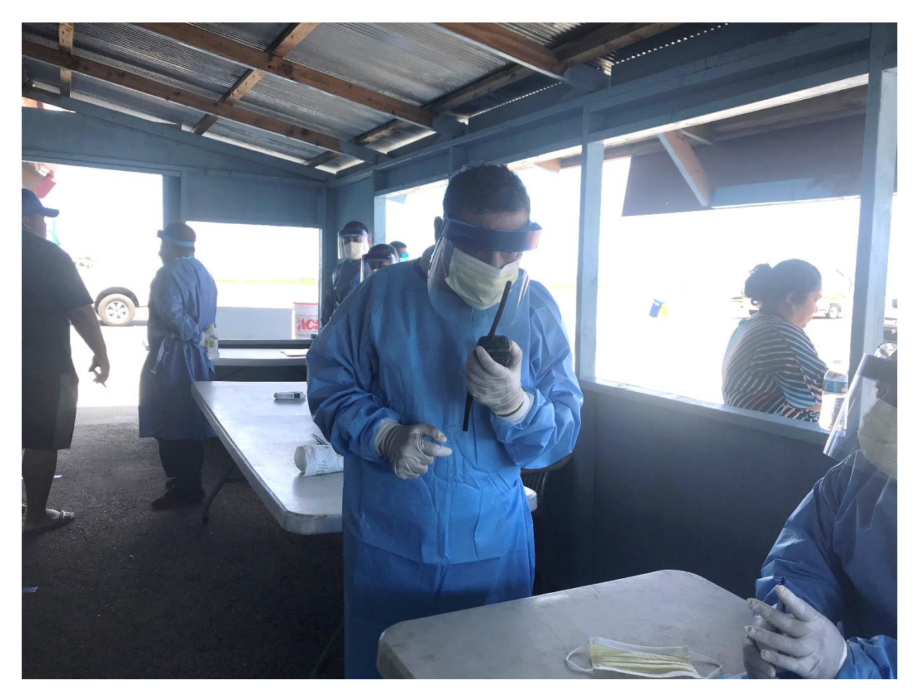
Pictured Above: The Incident Command Structure includes greater use of telephones and radios to increase Kosrae's speed and accuracy of communications