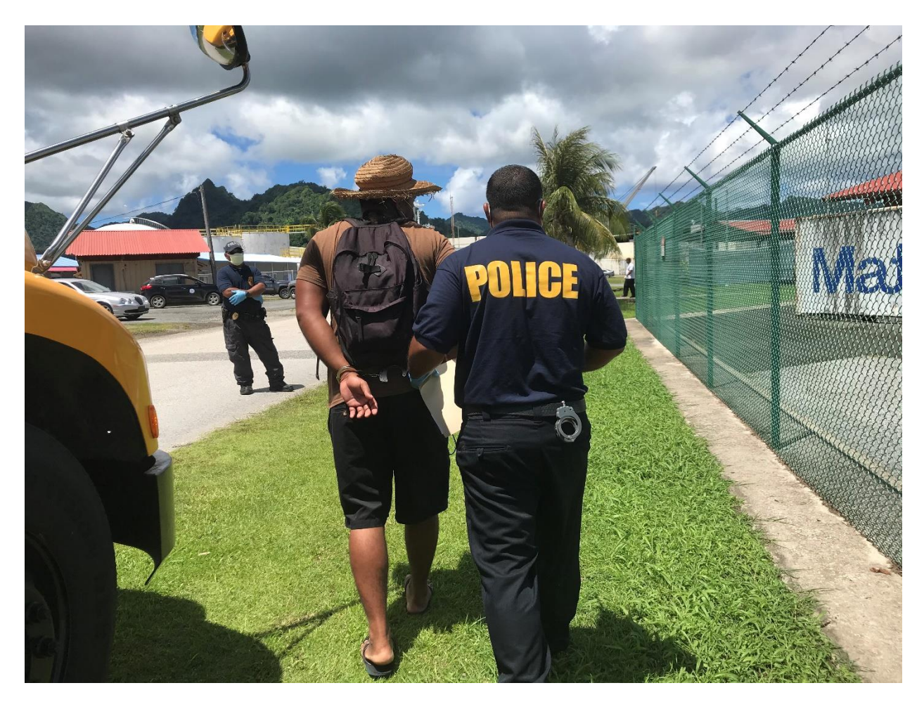
Pictured Above: Police escort a simulated PUI; note that the officer is wearing a mask and gloves, which is good—however, it was advised that if one comes into contact with a PUI that a face shield and gown are additional required PPE