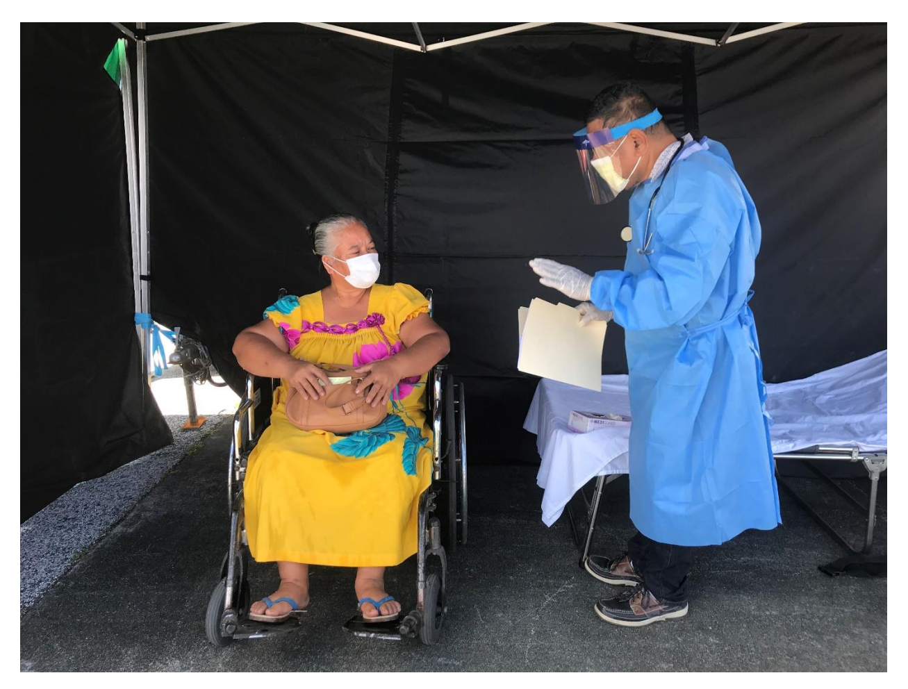
Pictured Above: A simulated passenger with physical disabilities is screened