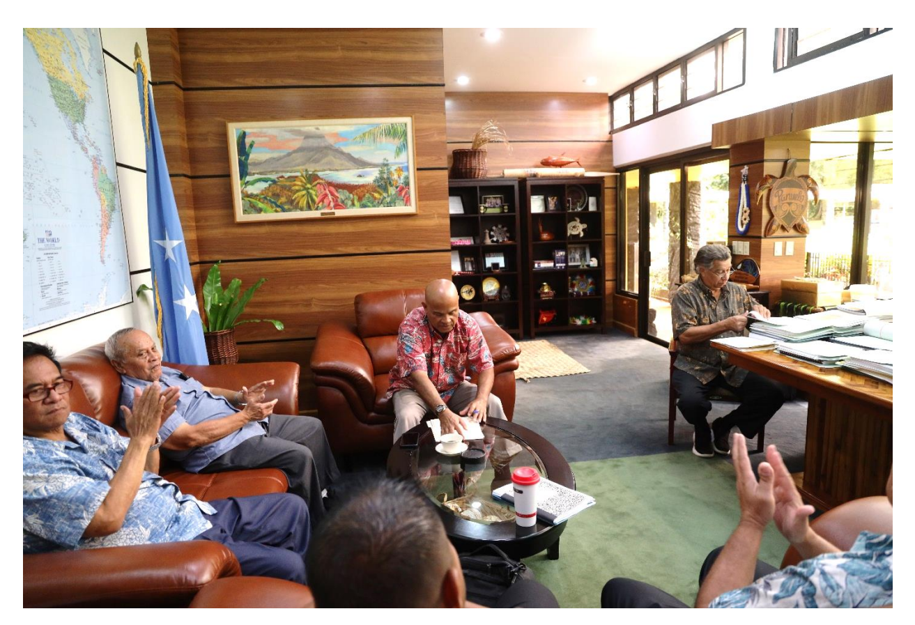
Pictured Above: The attendees of the meeting clap as the President finishes signing the Social Distancing Decree